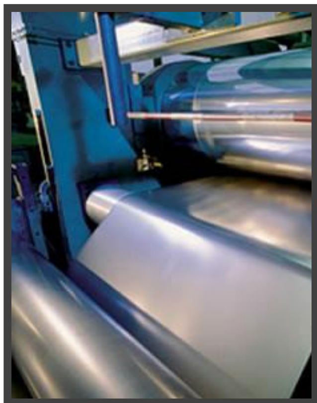
GEEGRAF Flexible Graphite Foil